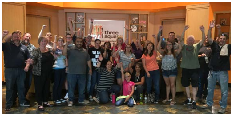
Southern Branch Shows Up Strong for Volunteering at Three Square

#seeingorangeNV #votenovember8 http://www.rtcsv.com/fri/index.html