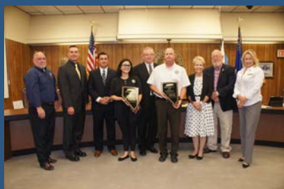
APWA Project of the Year award presentation at Boulder City Council Meeting