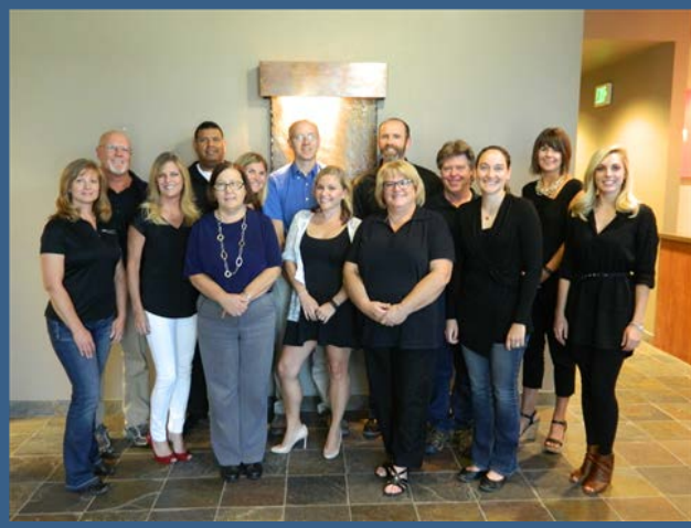
Fall 2016 Conference Committee